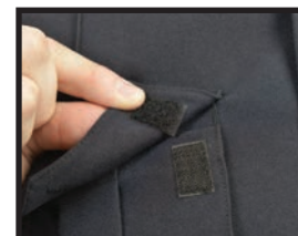
CHEST POCKETS WITH VELCRO CLOSURE