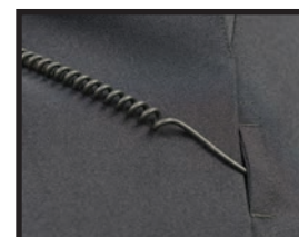
DUAL COMM WIRE ACCESS OPENINGS