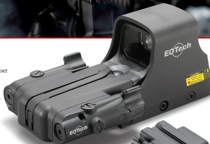
Available as upgrade accessory